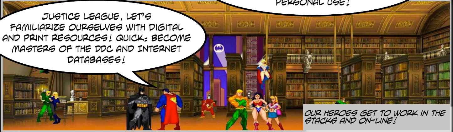
OUR HEROES GET TO WORK IN THE STACKS AND ON-LINE!

JUSTICE LEAGUE, LET'S FAMILIARIZE OURSELVES WITH DIGITAL AND PRINT RESOURCES! QUICK: BECOME MASTERS OF THE DDC AND INTERNET DATABASES!